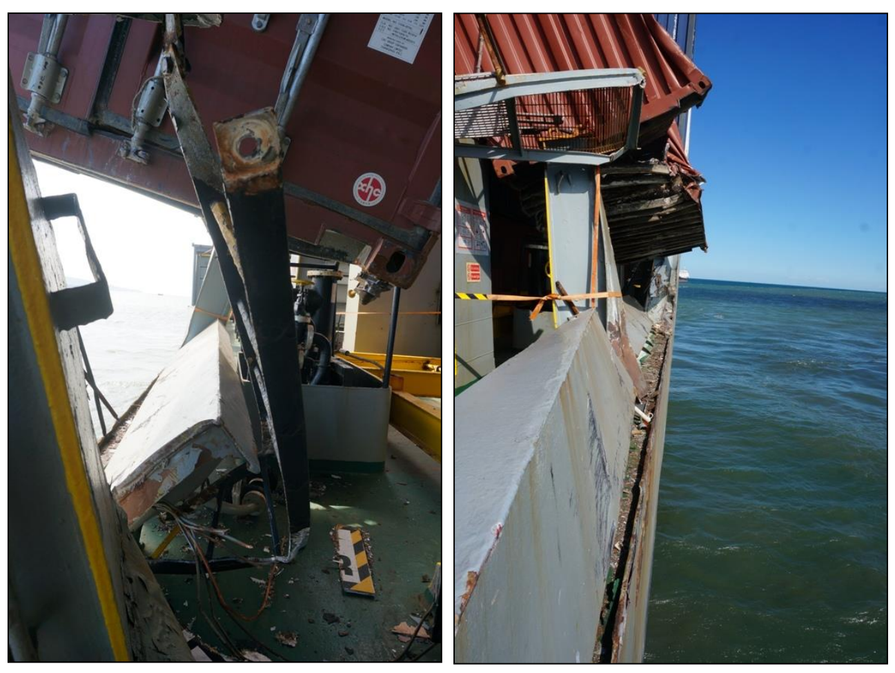
Figure 2: Damages sustained by Adam Asnyk

Six empty containers, which were above the damaged pillars, also sustained structural damages.